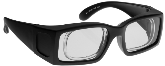
#55 Wraparound w/Insert