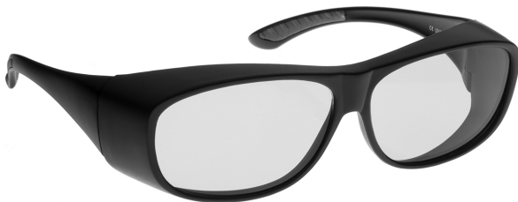
#51 Medium / #53 Large Universal