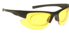
#34 Wraparound w/Insert