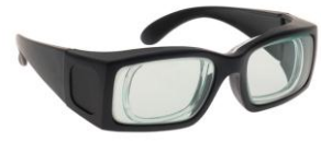
#55 Wraparound w/Insert