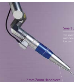
1 - 7 mm Zoom Handpiece