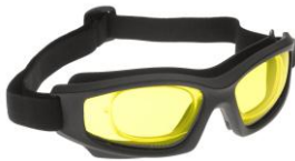
#50 Goggle w/ Insert