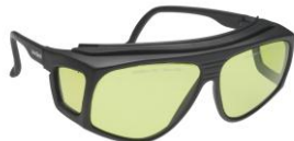
#31 Small / #39 Large Universal