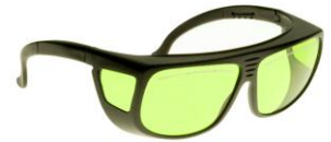
#36 Medium / #38 Large Universal