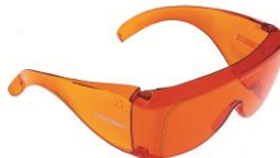
#700 Medium / #900 Large