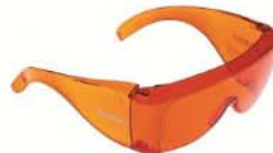
#700 Medium / #900 Large