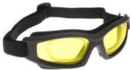
#50 Goggle w/Insert