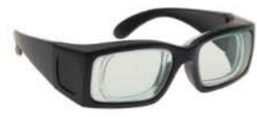
#55 Wraparound w/Insert